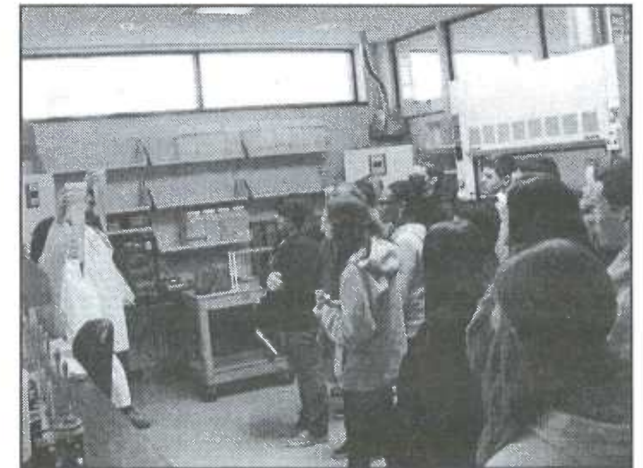
Students in the Laboratory looking at beakers of incoming and final effluent.